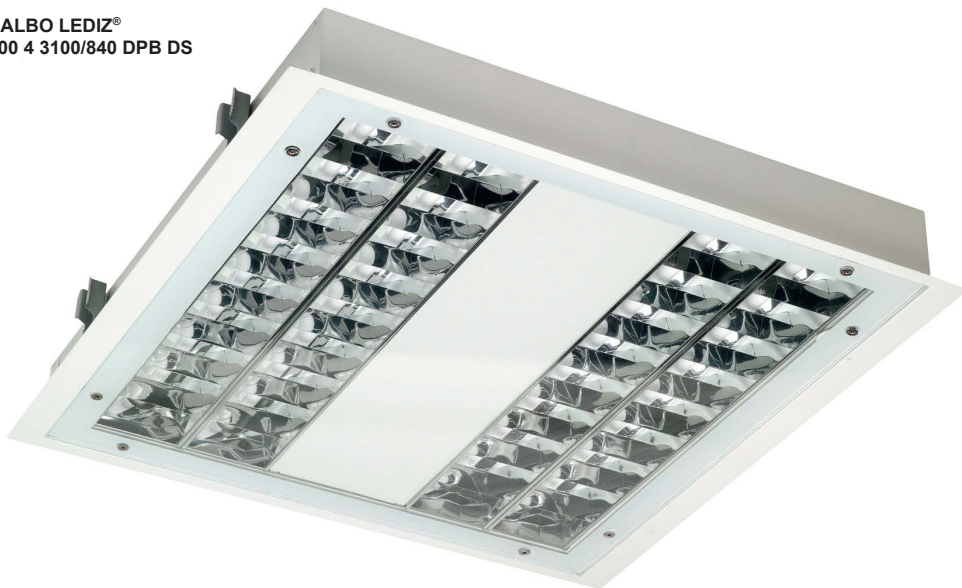
ALBO LEDIZ® M600X600 4 3100/840 DPB DS