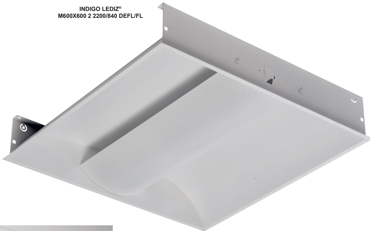
INDIGO LEDIZ® M600X600 2 2200/840 DEFL/FL