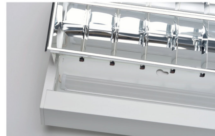
KLINO LEDIZ® L1200 2 3900/840 DPB