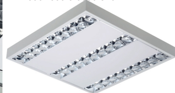
QUADRO-P LEDIZ® M1200X300 2 4700/840 DPB