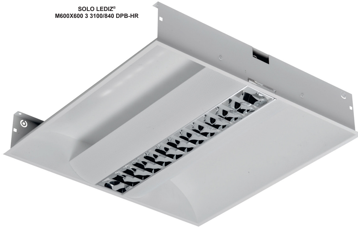
SOLO LEDIZ® M600X600 3 3100/840 DPB-HR